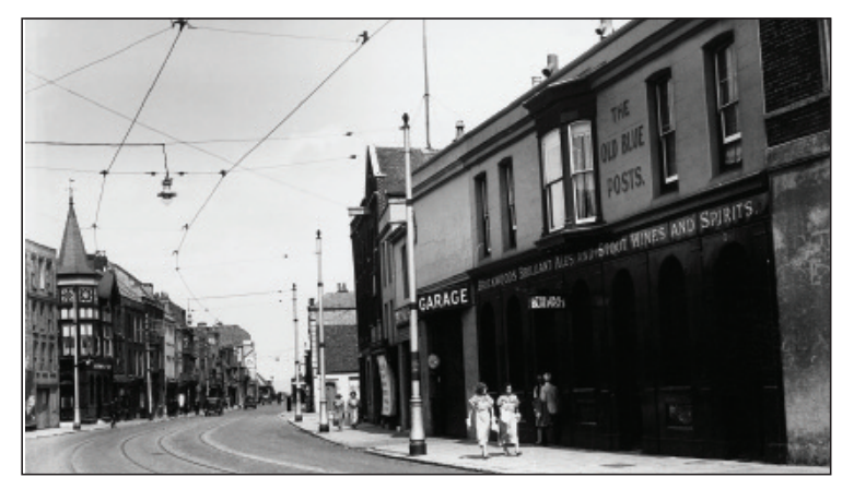
The Old Blue Posts in Broad Street, Old Portsmouth, which replaced the earlier inn made famous by Marryat.