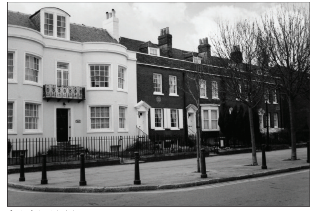
Charles Dickens's birthplace, a museum in what is now a pretty conservation area.