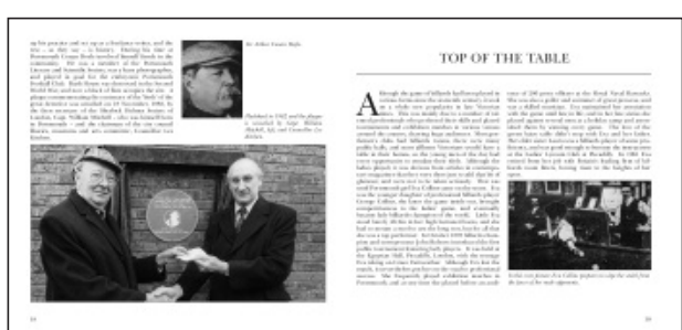
Example of a double page spread.