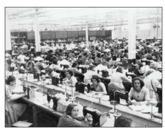
Workers at Leethem's Twilfit Marina factory in Highland Road at Portsmouth.