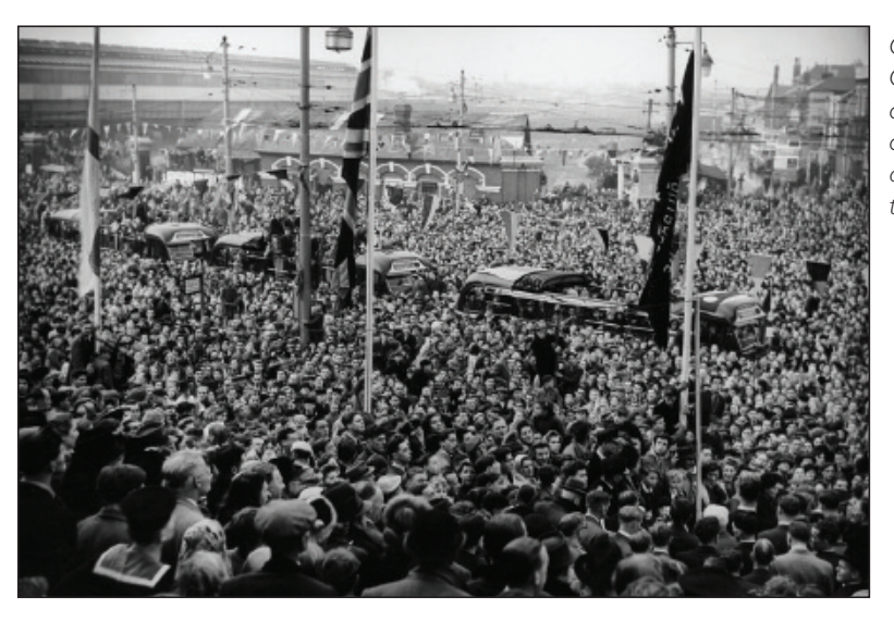
Crowds in the Guildhall Square clamour to see the conquering heroes and the all-important FA Cup.