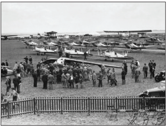
Crowds gather around the unusual Westland-Hill Pterodactyl aircraft at the airport opening day.